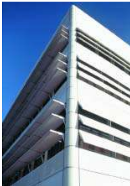
Baader Bank, Germany

This system offers building designers a unique solution to external solar shading systems.