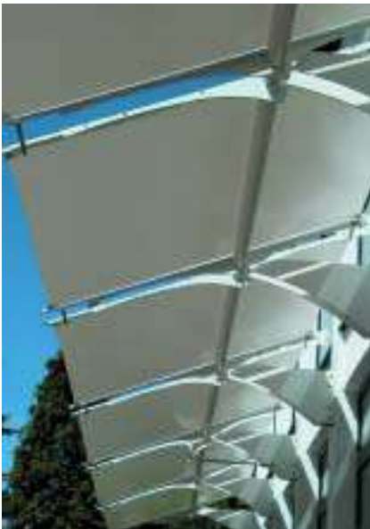
Voba Goch, Germany

This type of system is extremely lightweight which allows large spans to be constructed without the need for additional supporting framework.